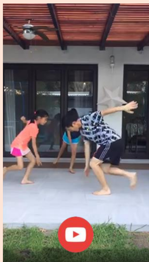
family.fit Five Steps

Find all the videos for family.fit at the family.fit YouTube® channel